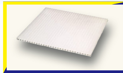
PC Board 6MM

Hot Galvanized Steel Frame : 2 X 1,75 X 8M (with 50 Pcs 0,81M*0,6M Plastic Plate)